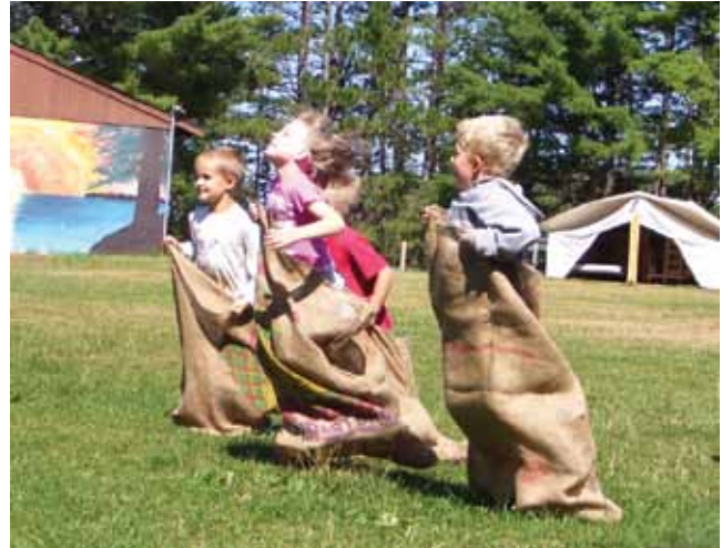
Day Campers Sack Race