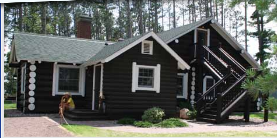
Nash Lodge July 2010

With your help, we can create a promising today and a brighter tomorrow for the kids, families and communities we serve. We always appreciate being notified when planned gifts have been established.