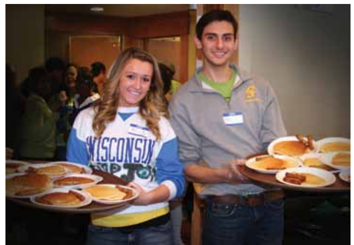
Volunteers serving up pancakes & sausage at the 47th Annual Pancake Breakfast