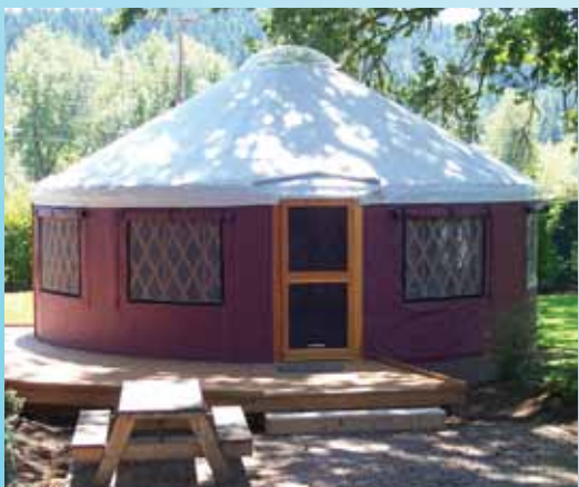
Camp Jorn's Yurts will look like this.